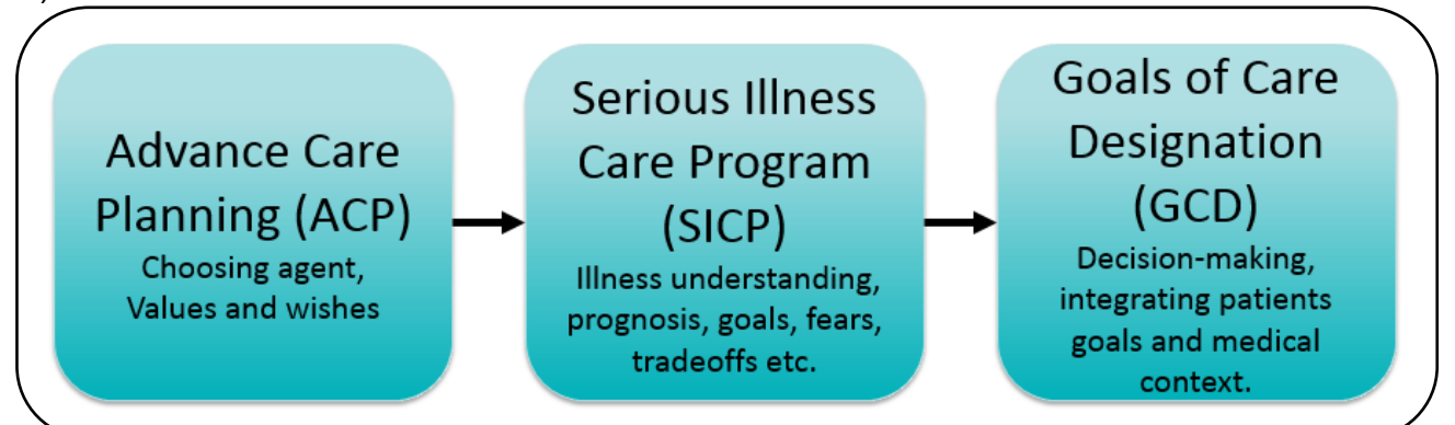
Figure 2. Conceptual model of where SICP fits within AHS's model of ACP and GCD determination.

Per AHS, "once a Goals of Care Designation conversation has been held, and if clinically indicated, a Goals of Care Designation order shall be created and documented in the Advance Care Planning/Goals of Care Designation Tracking Record." By documenting in a common place, follow up can be shared between the care team. The <u>Green Sleeve</u> is a plastic pocket used in Alberta as the specific resource to contain and transfer ACP documentation (e.g., GCD order, Advance Care Planning/Goals of Care Designation Tracking Record, Personal Directive copies, Guardianship Orders).