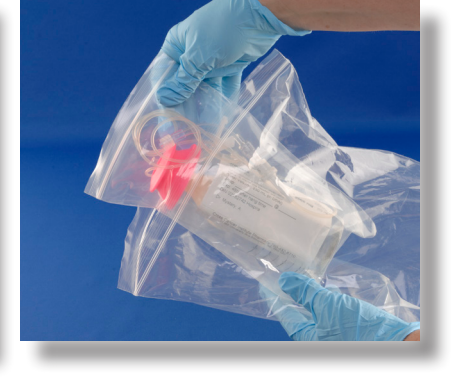
Make sure the clamps are closed to prevent leaking in the bag.