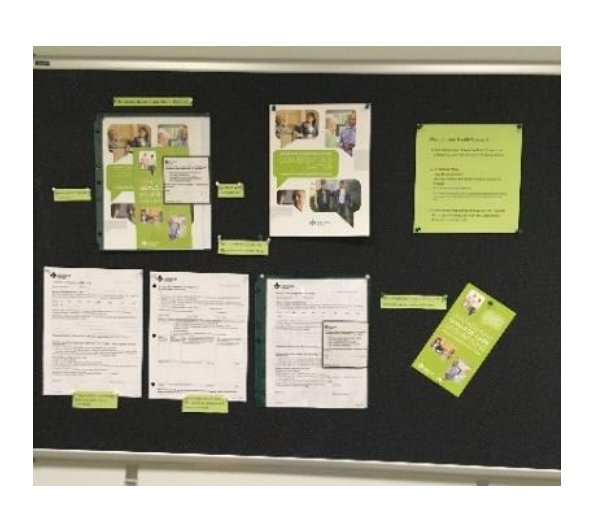
Patient and Family Room