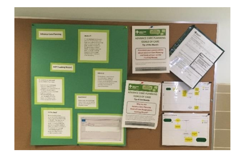
Staff room Board