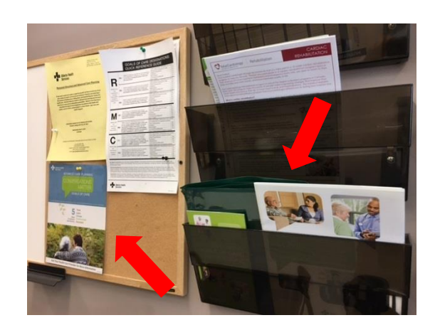
Outpatient Exam Room – Posters, booklets and Green sleeves

Be creative, keep the message up to date and change the visual frequently so it catches people eyes.