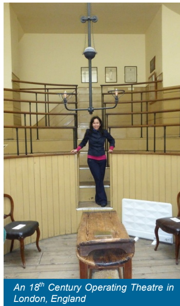
An 18 th Century Operating Theatre in London, England