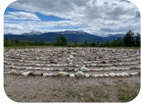
Grand Cache labyrinth

With the rollout of HAC 2.0 in 2020, Peace HAC successfully hosted virtual public engagement events within the constraints of the COVID-19 pandemic. This included two public meetings, one community engagement event session on Psychological First Aid and hosting a HAC booth at the Festival of Trees. The Festival of Trees is the largest annual fundraiser for the Grande Prairie Regional Hospital Foundation (GPRHF).