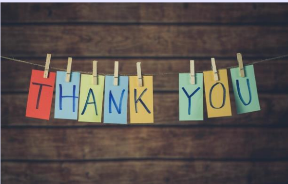
Thank you

Thank you from the Provincial PEOLC team and the Provincial Palliative End-of-Life Care Innovations Steering Committee (PPAL/EOLC ISC) to frontline clinicians and staff for caring for PEOLC patients and their families during this critical time. Thank you to those of you supporting PEOLC in other ways during this time such as providing direction, revising guidelines and creating documents to support patients, families and frontline healthcare providers. Please take care of yourselves and your families in these unpredictable times and know that your work is needed and very much appreciated.