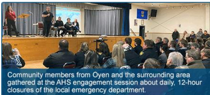
Community members from Oyen and the surrounding area gathered at the AHS engagement session about daily, 12-hour closures of the local emergency department.

Oyen Community event begins important conversation