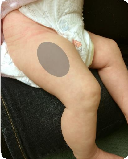
DIAGRAM A Upper, Outer Thigh Muscle (Vastus Lateralis)