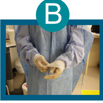
HCP tucks hands inside cuffs of gown.