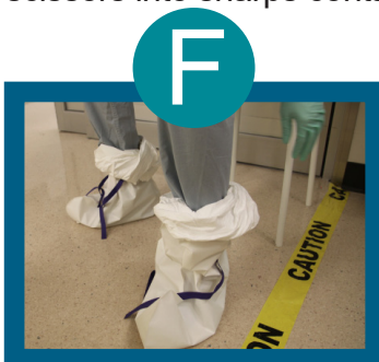
HCP sits. Do not cross legs.