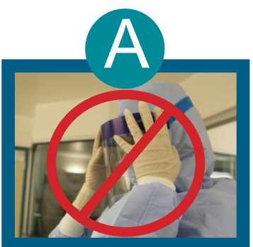
Do not touch front of face shield.