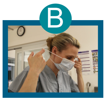
Remove personal eye glasses, if worn. Bend slightly forward and remove mask by grasping loops.