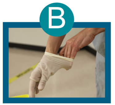
HCP removes inner gloves, drops into biomedical waste container.