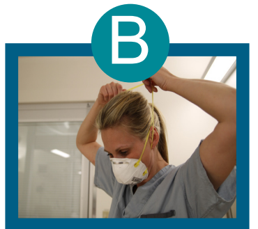
Remove top band and carefully remove respirator from face.