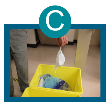
Drop mask into biomedical waste container.