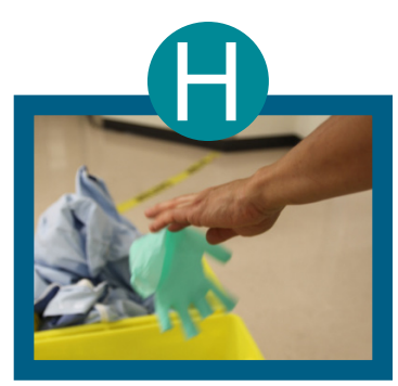
HCP and Buddy Buddy pulls off, and drops into biomedical waste remove gloves, drop in biomedical waste container.

doffing area as it is removed from leg cover and