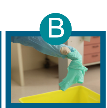
Drop gloves into biomedical waste container.

www.albertahealthservices.ca/topics/Page10289.aspx For more information contact ipcsurvstdadmin@ahs.ca © 2019 Alberta Health Services