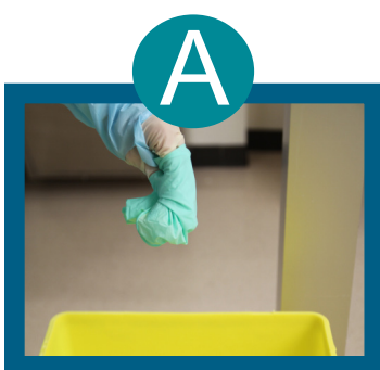
Remove gloves with care.