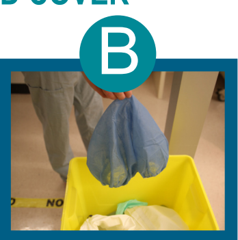
Drop bouffant head cover into biomedical waste container.