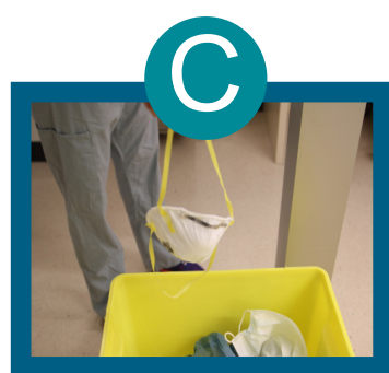
Drop respirator into biomedical waste container.