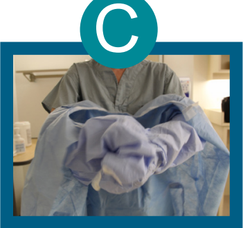
HCP pulls down from the shoulders and away biomedical waste from body, one sleeve at container. a time, folding outer surfaces towards each other.