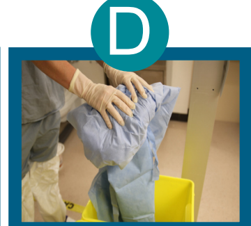
HCP drops gown into