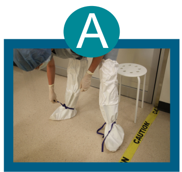
With legs apart, HCP reaches down to untie straps.