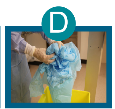
HCP gently folds apron and drops into biomedical waste container.