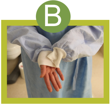
Tuck hands inside cuffs of the gown.