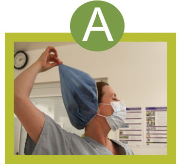
Pull bouffant head cover backwards off head.