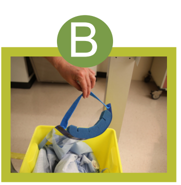
Drop face shield into biomedical waste container.