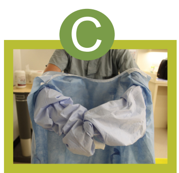
Ease gown forward and outward, only touching inside of gown.