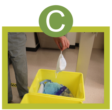
Drop mask into biomedical waste container.