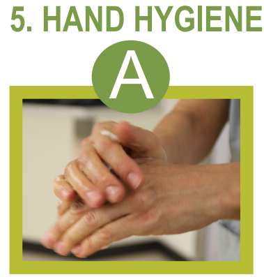
Use an alcohol-based hand rub.

www.albertahealthservices.ca/topics/Page10289.aspx Page 2 of 5