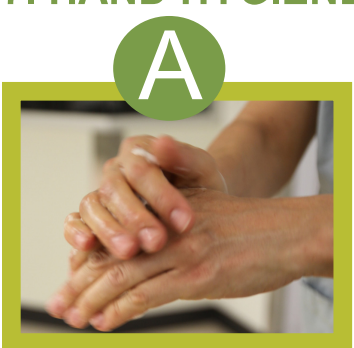
Perform hand hygiene using alcohol-based hand rub.