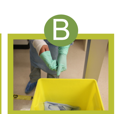
Drop gloves into biomedical waste container.

www.albertahealthservices.ca/topics/Page10289.aspx For more information contact ipcsurvstdadmin@ahs.ca