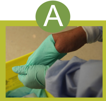
Remove gloves with care.