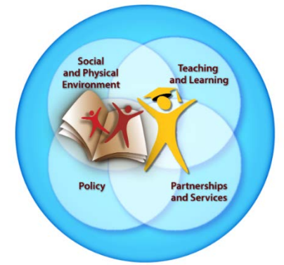
Figure 4. The Comprehensive School Health Approach

Alberta Education recognizes the importance of taking a whole-school approach to promote positive mental health in schools to ensure that students and staff feel supported and included in their school community.<sup>3</sup> AHS supports the implementation of the Comprehensive School Health (CSH) approach, an evidence-based framework for health promotion in schools. Using the CSH approach, schools align their efforts to create a school culture that supports positive mental health promotion for all members of their school community.