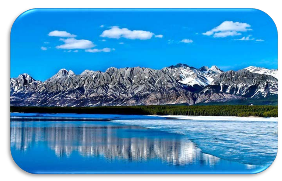
"It's a New Year. A perfect opportunity to do something new, something bold, something beautiful!" – Unknown