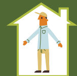
Indoors @ dawn & dusk.